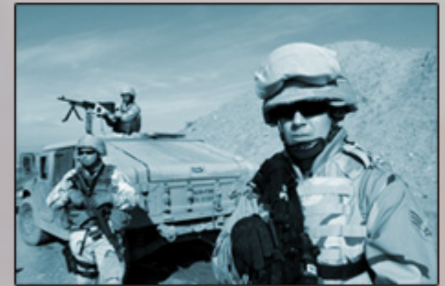
Deployment? Not gonna happen.

I am an Airman on Profile; Victim, follower, casualty. I will always be the Airman behind. I will always falter. And I will fail.