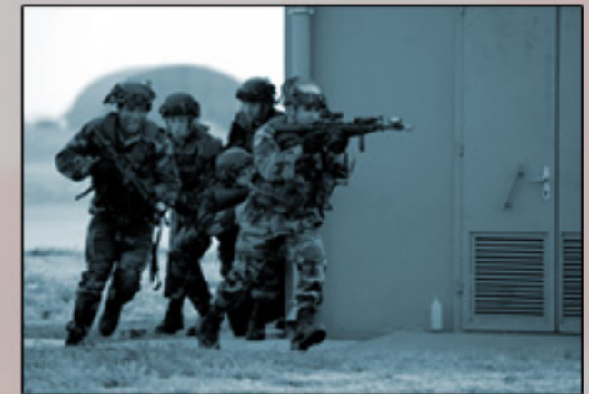
Readiness training? I dont think so.