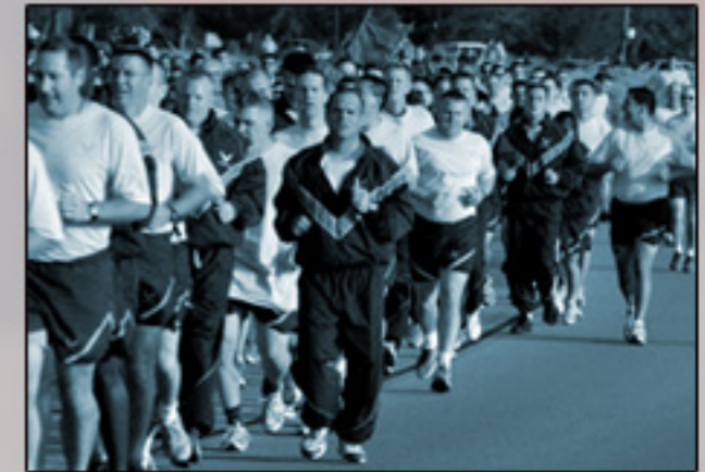
Fitness test? Doctor says I can't.